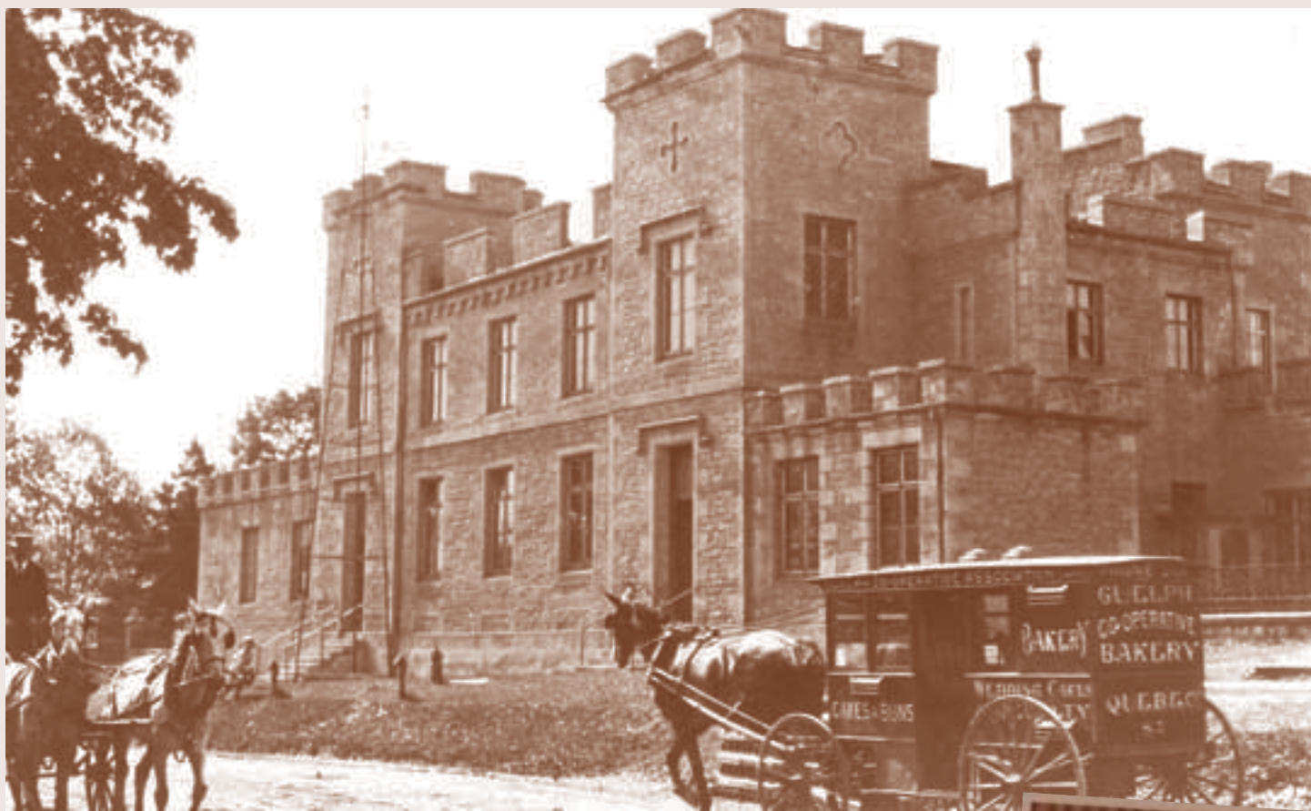
WELLINGTON COUNTY MUSEUM AND ARCHIVES, PH 6850

Bread was sold at a higher price in Guelph than was asked by the same dealers for the same commodity in the surrounding area.